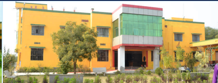
Indian College of Nursing Science