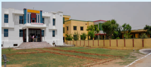
Indian Institute of Teacher Training