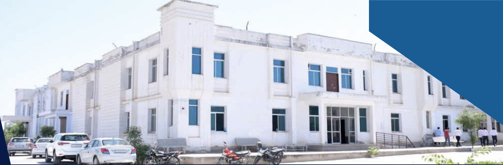
Indian Group of Institution