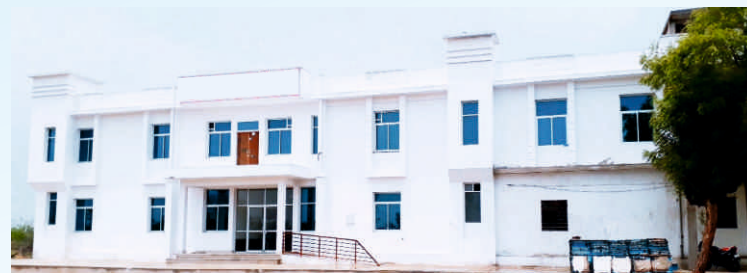
Indian College of Pharmacy