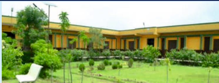
Indian Institute of Paramedical Science